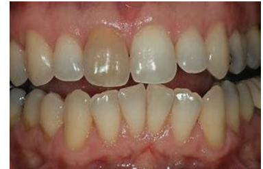
Figure 1: Darkened tooth

Please contact the clinic on the number below if you require any additional information.