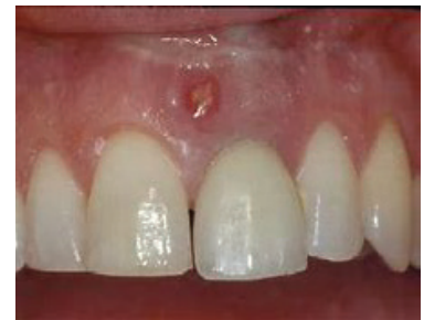
Figure 2: Swelling between two front teeth